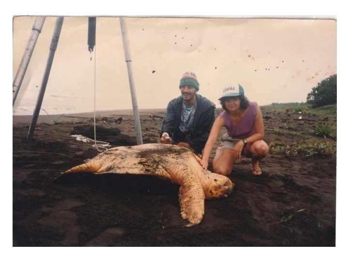
Fig 3. Female loggerhead turtle ( Caretta caretta ) being marked, measured and weighted after successfully nesting at Tortuguero beach.

Mean CCLmin for Loggerhead Sea Turtles documented at Tortuguero (98.2 \pm 3.7 cm) was similar to that described at other nesting sites around the North Atlantic, such as the Archie Carr National Wildlife Refuge in Florida (98.2 \pm 0.15 cm) (Ehrhart et al., 2014) and Isla Juventud in Cuba (98.5 \pm 10.3 cm)