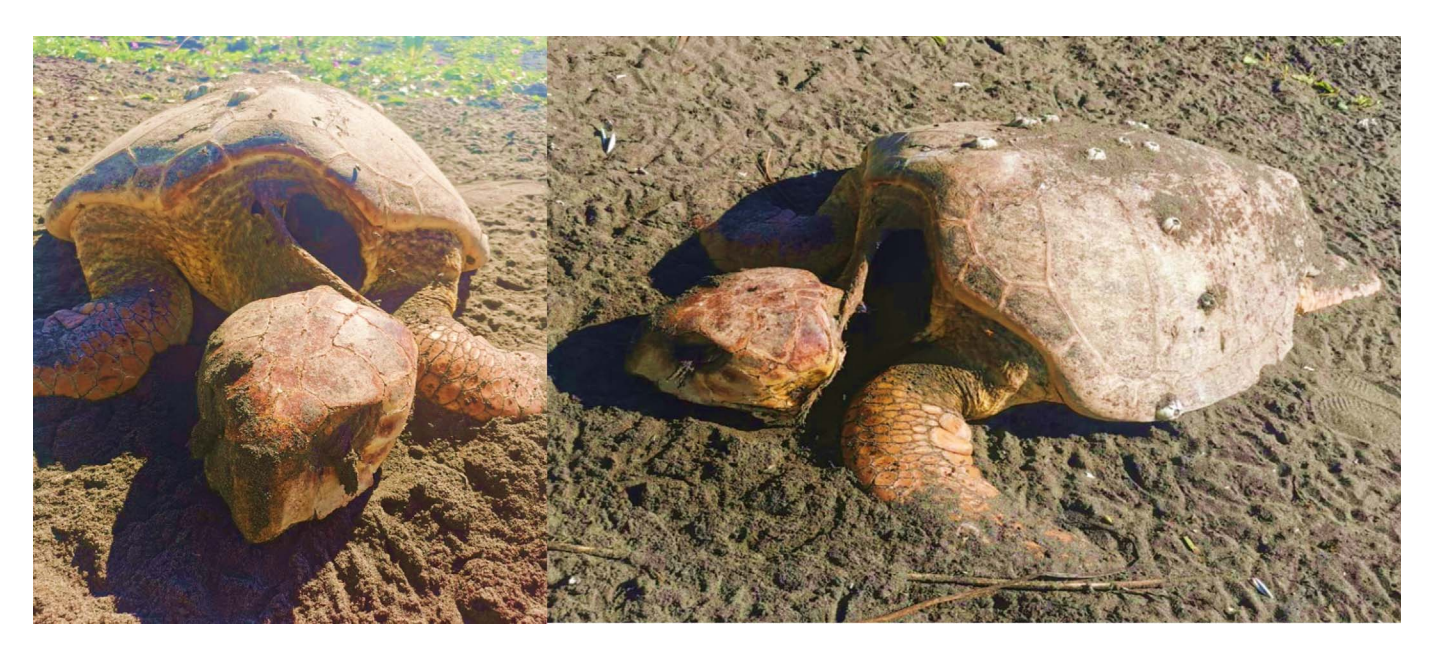
Fig 2. Nesting Loggerhead Sea Turtle killed by jaguar ( Panthera onca ) in Tortuguero National Park in 2021. Jaguar tracks were covered by the presence of scavenging vultures; the carcass was dragged by the jaguar into the thick vegetation later that day.

encounters were recorded nesting in Playa Norte, just 5 km north of TNP: two in 2006 and one in 2017 (J. Gutiérrez-Lince and M. Hughes, pers. com.). Similarly, two Loggerhead nesting attempts were documented at Parismina beach, south of TNP, by the Association Save the Turtles of Parismina (ASTOP) in 2015 and 2019. Finally, in 2020, a nesting Loggerhead was reported on Playa 3, just 2 km south of TNP's southern limit (R. Saragoça Bruno, pers. com.). These reports suggest that perhaps the occurrence of Loggerhead Sea Turtles is frequent at other nesting sites on the Caribbean coast of Costa Rica. Furthermore, these findings highlight the importance of collaboration among sea turtle organizations to gather reliable information that will improve our knowledge of this species in the Caribbean.